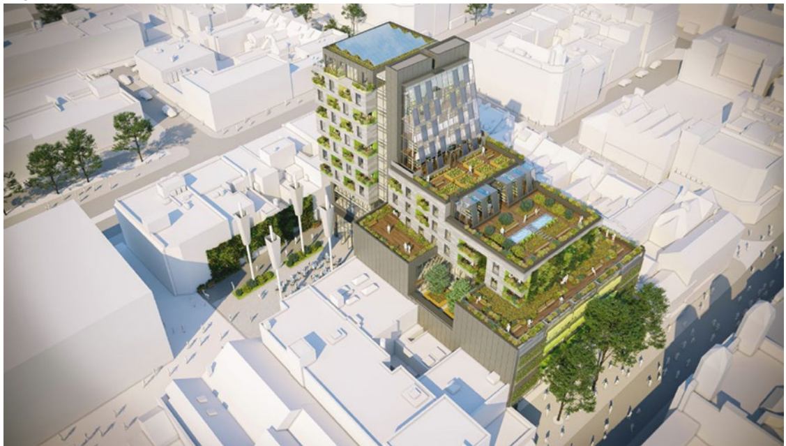
Source - Powell Dobson Architects (2019) Design and Access Statement

Figure 10 - Proposed Biophilic Living scheme at Picton Yard, Swansea