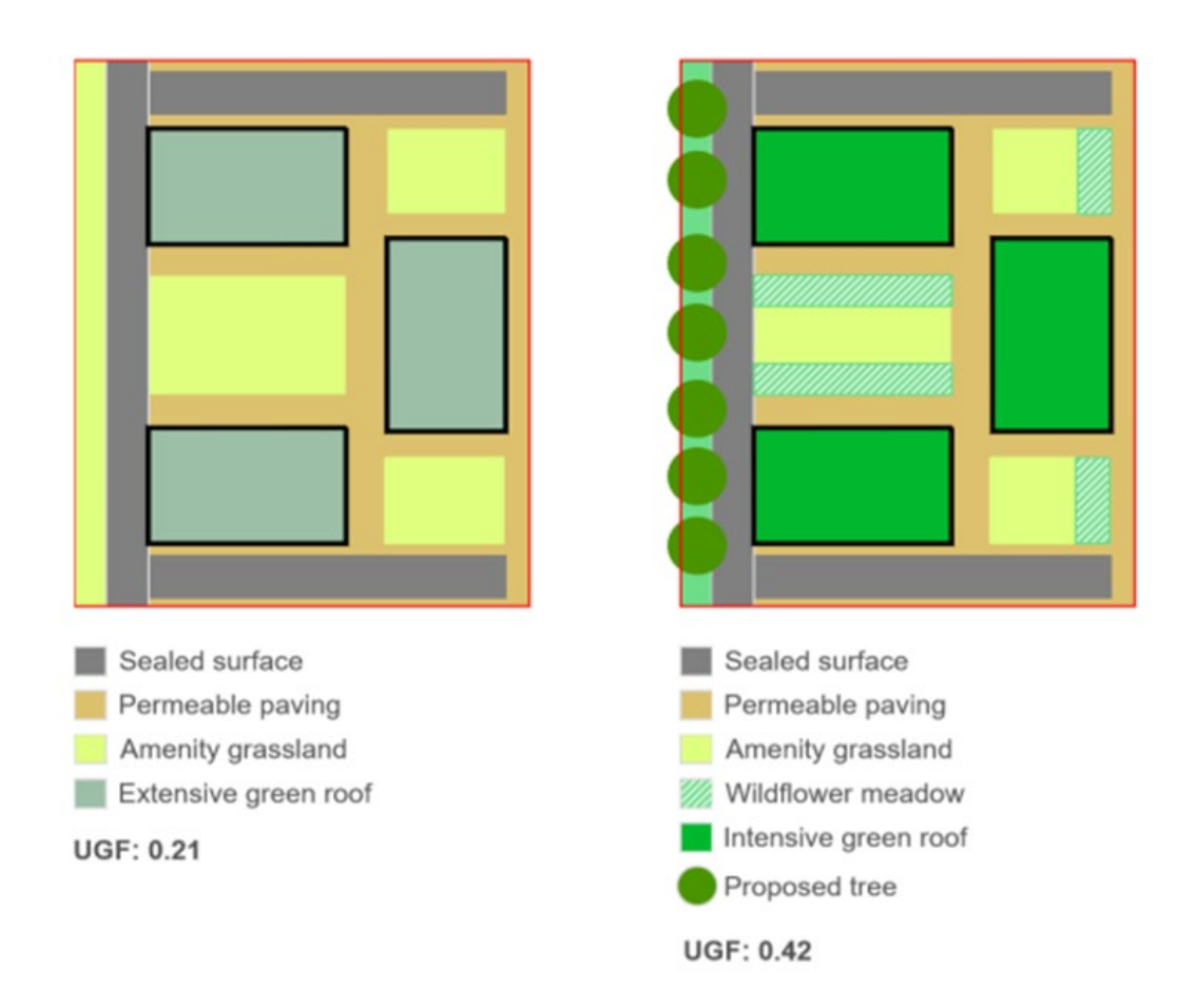
Figure 5 – Theoretical calculations of the UGF for a simplified development site

Source - <u>The London Plan Guidance – Urban Greening Factor (2021)</u>, figure 3.1 page 9 Currently the UGF is only applied to 'Major Developments' which is defined in <u>the</u> London Plan (GLA, 2021, p512) as: