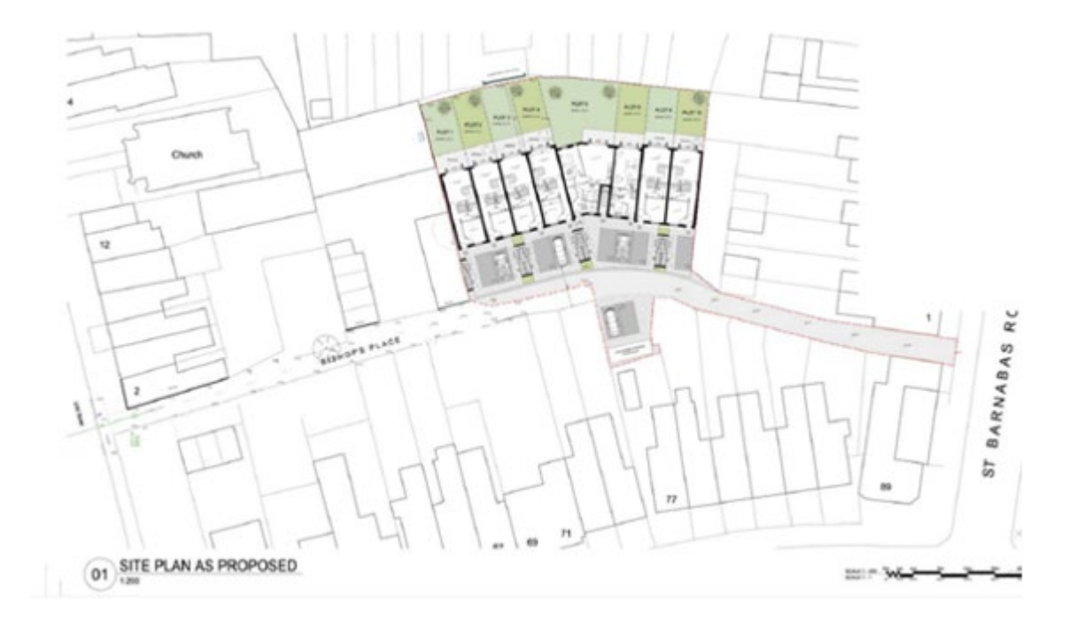
Figure 4 - Bishops Place, Sutton, Planning Application