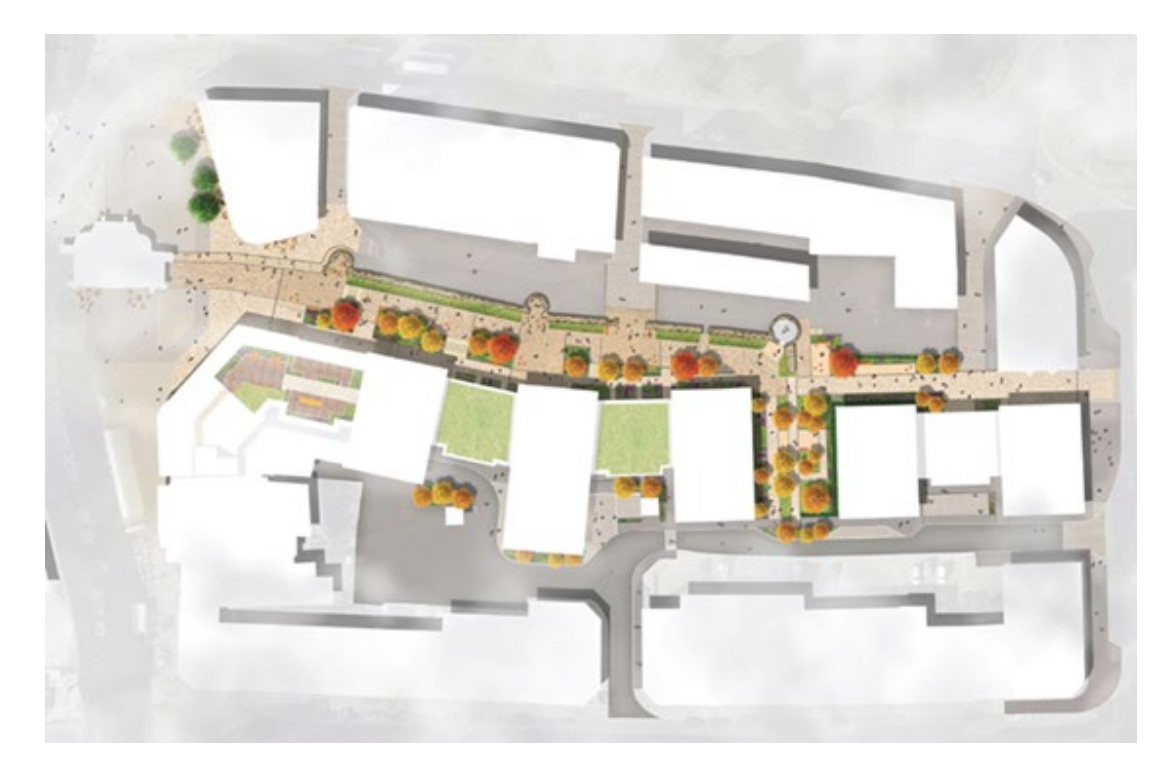
Figure 2 - Landscape Masterplan and GSF Score for Bargate Shopping Centre, Southampton