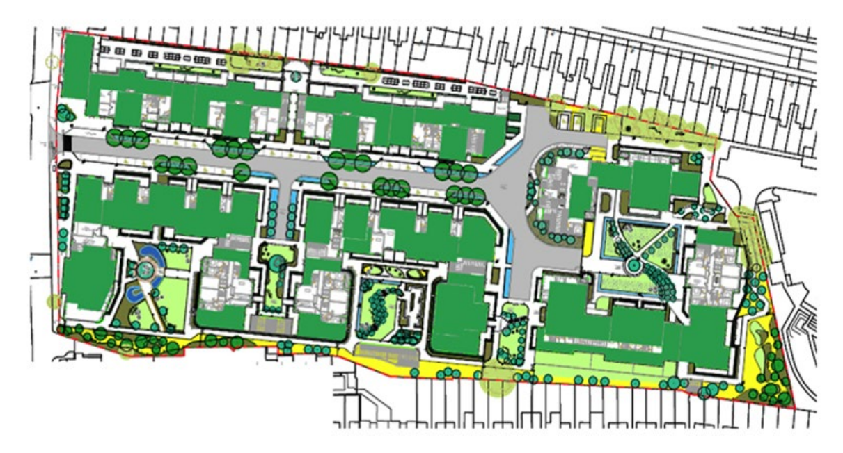
Figure 8- Lambeth Hospital Landscape Masterplan