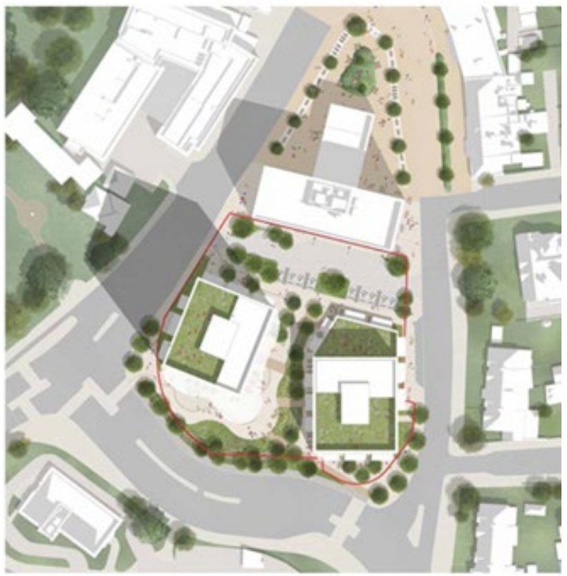
Figure 7 - Watercress Island Landscape Masterplan