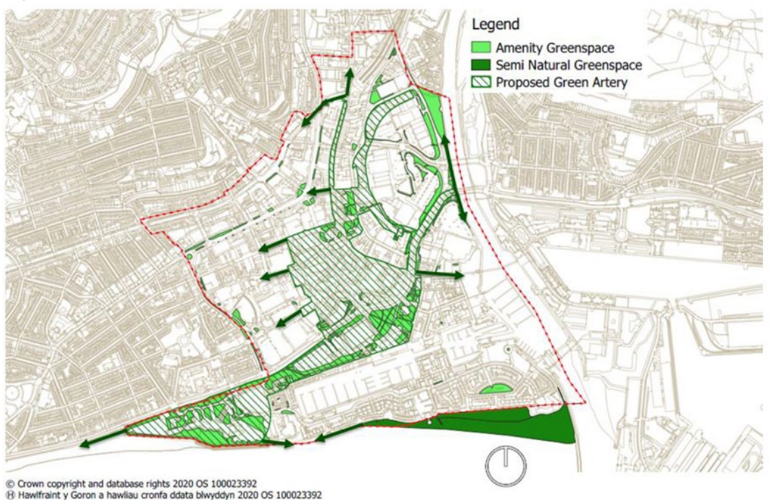
Figure 9 - Swansea Central Area and Green Artery that is the focus for GI investment.

Source – <u>Natural Resources Wales and Swansea Council (2021) Swansea Central</u> Area; Regenerating Our City for Wellbeing and Wildlife, February 2021, p41